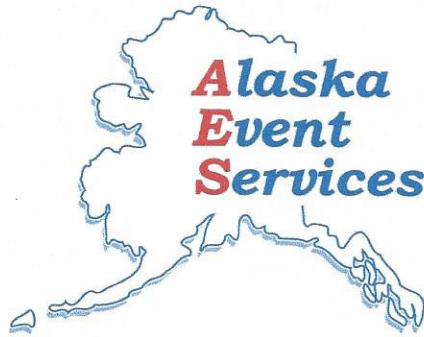
Exhibit Equipment Rental Form